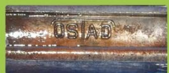
Cast Iron Cylinder Shell