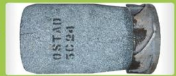
Stone Cylinder Shell