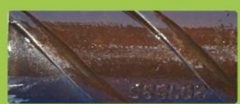
Cast Iron Cylinder Shell

After years of dedicated effort we have made a breakthrough to be the first to make a huller that does not remove vital vitamins & proteins from the rice.